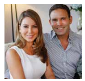
"I'VE BEEN A BOTOX LOYALIST SINCE MY EARLY THIRTIES"